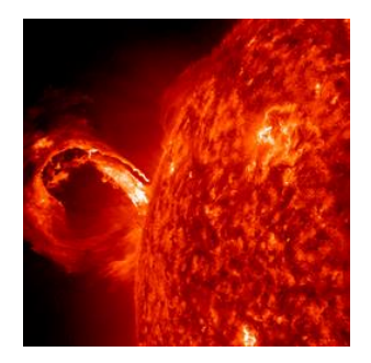
A 2013 coronal mass ejection.

get off to a slow start, but is anticipated to peak between 2023 and 2026 with a sunspot range of 95 to 130. This is well below the typical average of 140 to 220 sunspots per solar cycle. The panel expressed high confidence that the coming cycle should break the trend of weakening solar activity seen over the past four cycles. The Solar